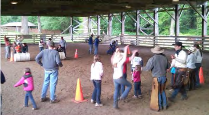
Kid's rodeo at Miracle Ranch