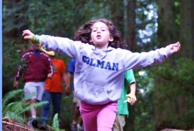
Camp Colman 'herbivore' running for her life.