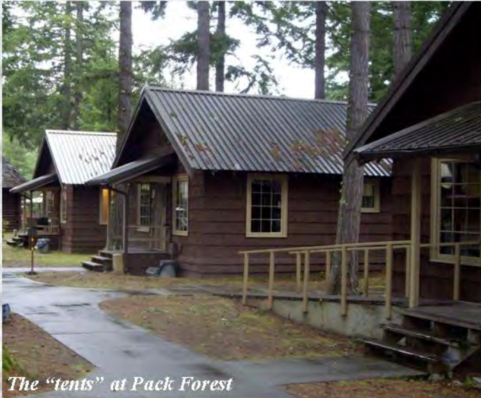
The "tents" at Pack Forest