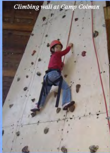
Climbing wall at Camp Colman