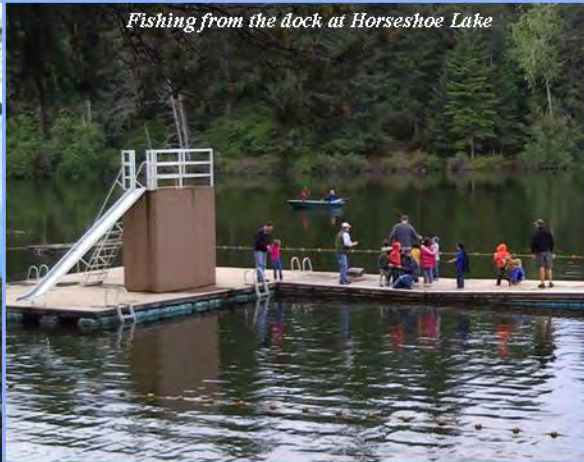
Fishing from the dock at Horseshoe Lake