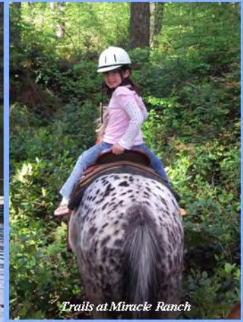
Trails at Miruck Ranch