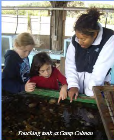
Touching tank at Camp Colman