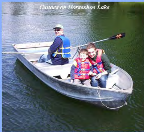
Canoes on Horseshoe Lake